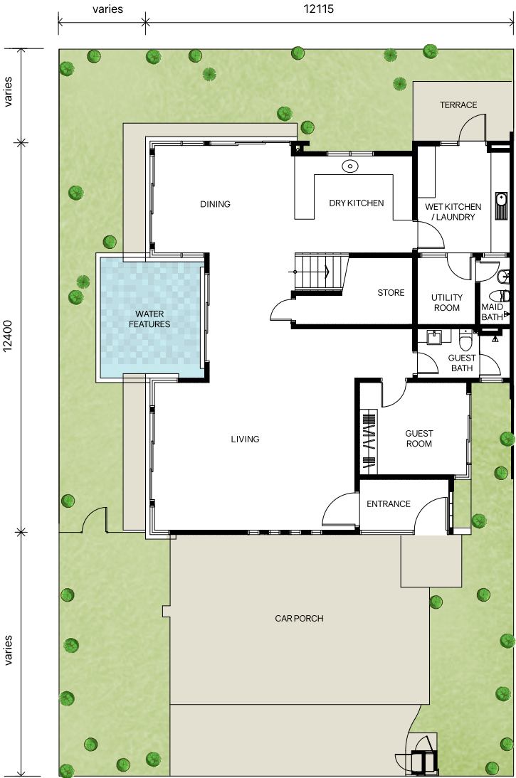
Ground Floor Plan 底层平面图